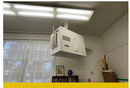
Outdated HVAC unit in a South Elementary School classroom.