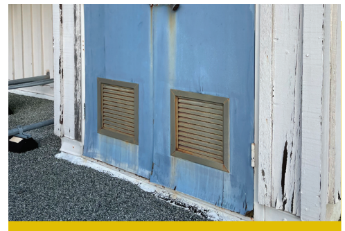
Weathered and damaged doors at West Elementary School.